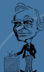
Caricaturist and cartoonist